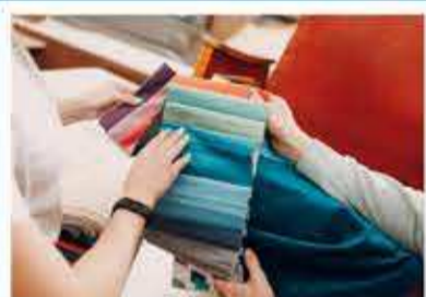
Apparel, Fabrics and Garments