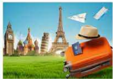
Tours and Travels