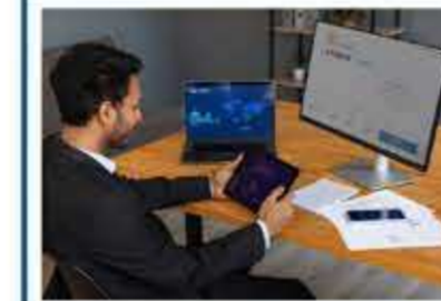
Shares and Stock Brokers