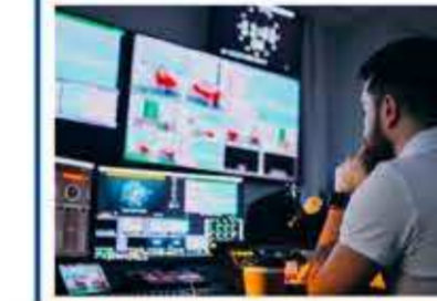
Broadcasting and Media