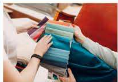
Apparel, Fabrics and Garments