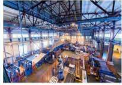
Manufacturing And Production