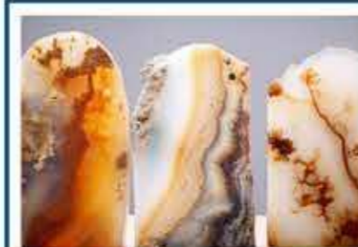
Marble and Quartz