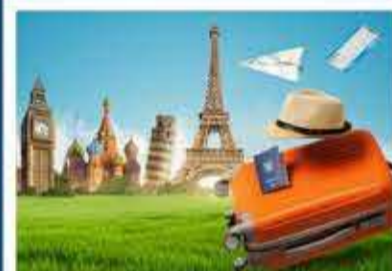
Tours and Travels