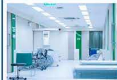
Hospital / Healthcare