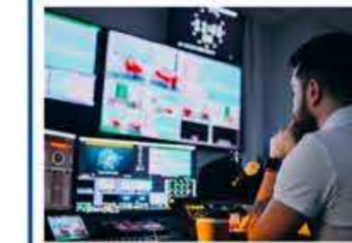
Broadcasting and Media