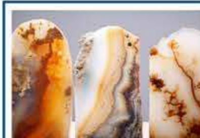
Marble and Quartz