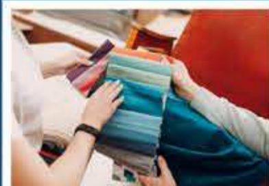
Apparel, Fabrics and Garments