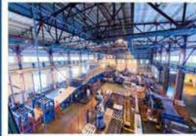
Manufacturing And Production