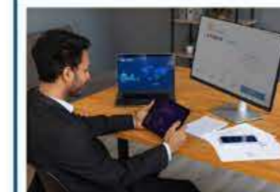
Shares and Stock Brokers